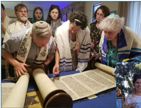
Comparing our two Torah scroll styles