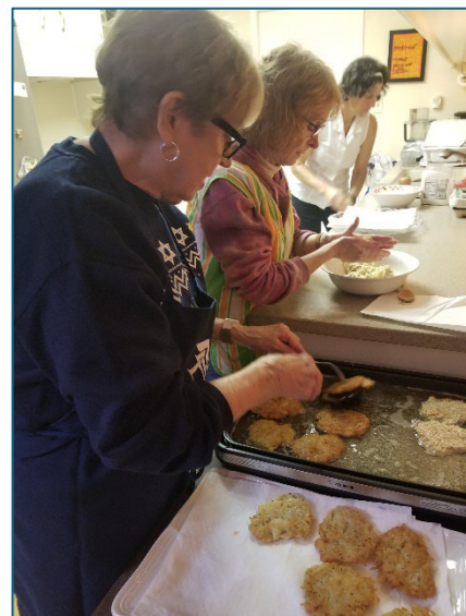
The latke making crew in action