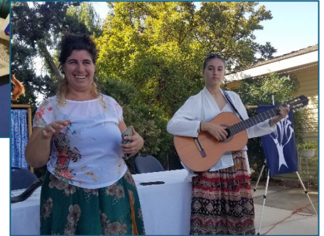
Rosh Hashanah guests from Israel