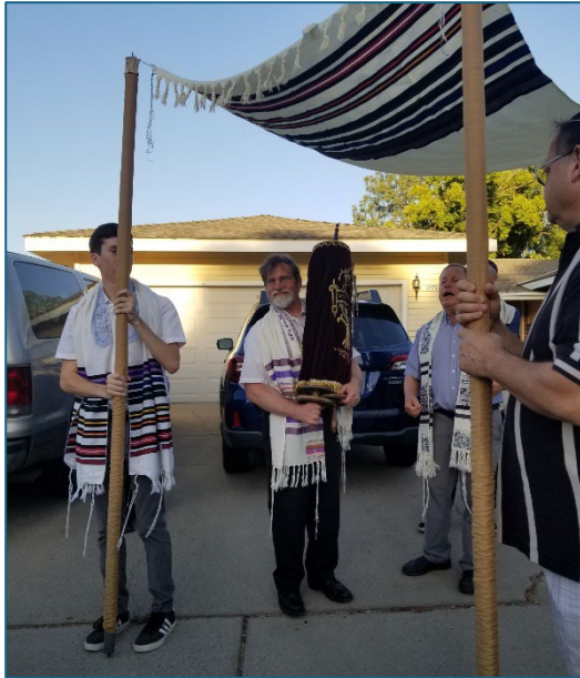
Welcoming a new Torah this summer